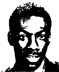
Top high school heroes include (clockwise) Michael Jackson, Eddie Murphy and Julius Erving.